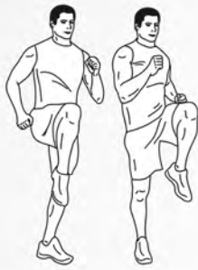
20sec high knees

Level I 3 sets Level II 5 sets Level III 7 sets | 2 minutes rest