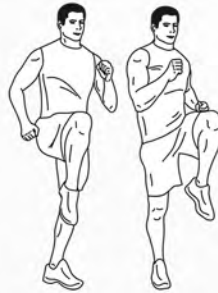
20sec high knees