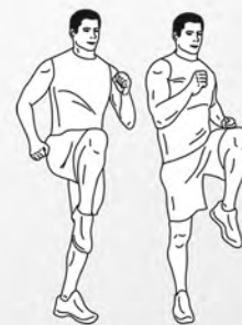
20sec high knees