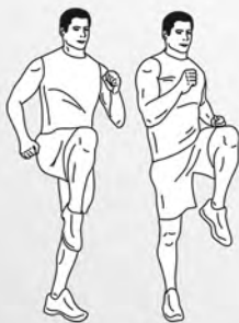
20sec high knees