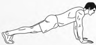
20sec plank hold