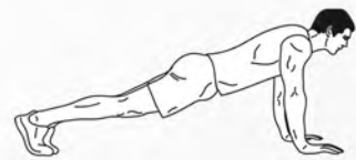
20sec plank hold