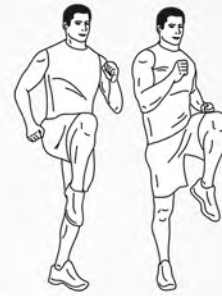
20sec high knees