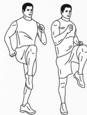
10 high knees