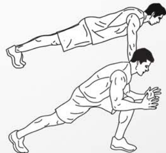
10 plank into lunges