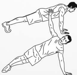
10 planks with rotations