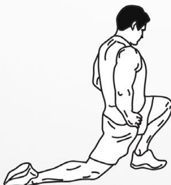
kneeling hip flexor